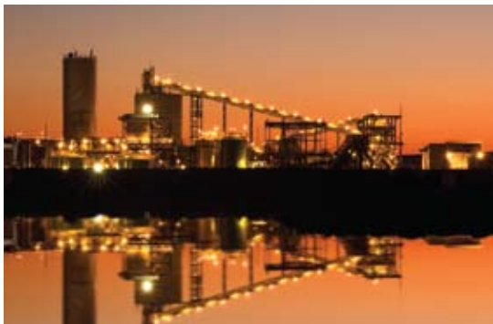
The Las Cruces processing facility was ready for commissioning at the end of the year.

There was one potentially life-threatening injury during the year. A contractor working on the top of one of eight leaching reactors stepped onto a temporary cover over a porthole and fell 12 metres to the base of the reactor. The worker suffered several broken bones, but was immediately stabilized and transported to hospital. His injuries were significant and we are thankful that he has recovered. CLC's investigation revealed that although he had been provided with the appropriate working-at-heights training and personal protective equipment, he did not connect himself to an anchor point. Moreover, a dual lanyard was not present, which would have allowed him to move between anchor points while still being connected. Following an investigation, Spanish labour authorities levied a €300,000 fine against Las Cruces. Further investigation and clarification resulted in the fine being reduced to €30,000. Las Cruces continues to challenge this fine because it believes that it more than fulfilled its responsibilities in this instance.