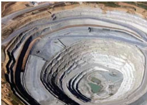
The Las Cruces open pit at the ore level.