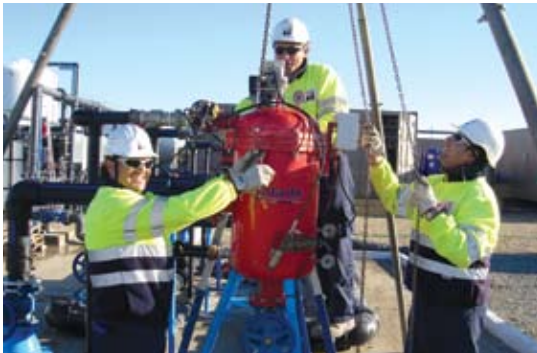
Prior to mining operations at Las Cruces, CLC implemented water treatment and water management facilities and systems that are best in class to ensure that the region's valuable water resources are protected.

Las Cruces reported 30 environmental incidents during the year, including 22 petroleum spills, four spills of process reagent, three releases of untreated water and one spill of hazardous waste. The majority of the 22 petroleum spills resulted from hydraulic hose breaks on heavy equipment. The average spill size was eight litres and all spills were cleaned up immediately and any contaminated material disposed of according to regulations. The process reagent spills involved hydrochloric acid, sulphuric acid and aluminum chloride, all of which are used in maintenance of the engineered membrane water purification equipment that it uses to purify ground water. The releases of untreated water were all caused by pipe leaks that were repaired immediately. Such issues are common in new plants and Las Cruces' commissioning process is designed to detect and correct these types of issues. The spill of hazardous waste involved used oil which was detected in a storm water sump. After extensive investigation, we were unable to determine the exact cause or source of this material.